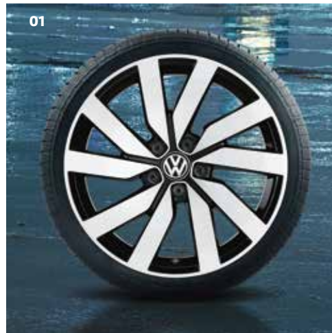
01 Volkswagen Genuine Marseille alloy wheel, 18 inch, black, gloss machined Part. no. 3G0.071.498.A.FZZ