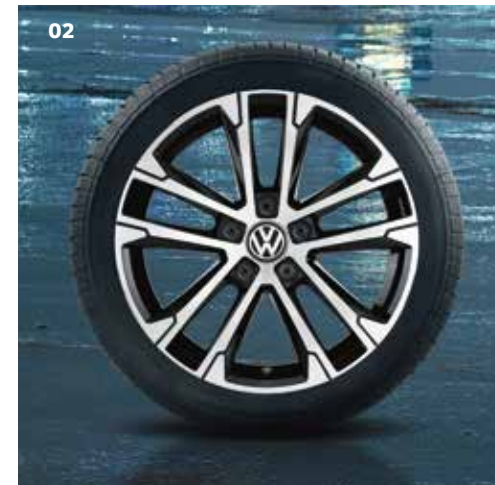
02 Volkswagen Genuine Singapore alloy wheel, 17 inch, black, gloss machined Part. no. 3G0.071.497.A.FZZ