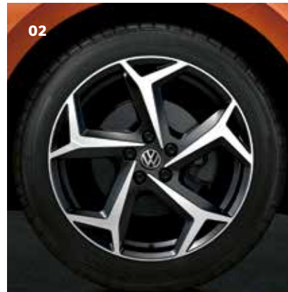
02 Bonneville, alloy wheel 17", black gloss machined Part. no. 2G0071497FZZ