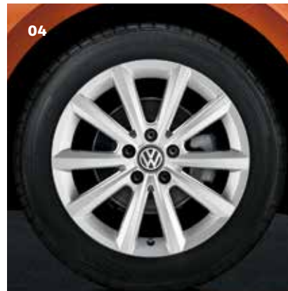
04 Merano, alloy wheel 16", brilliant silver Part. no. 2G00714968Z8 (Not for GTI)