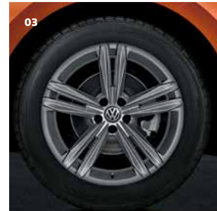
03 Sebring alloy wheel 16", grey metallic Part. no. 2G0071496AZ49 (Not for GTI)