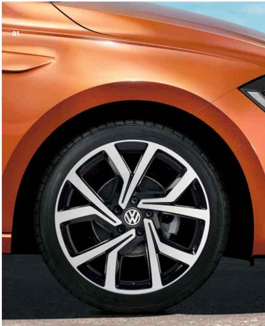
01 Brescia, alloy wheel 18", black gloss machined Part. no. 2G0071498FZZ