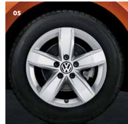
05 Corvara, alloy wheel 15", brilliant silver Part. no. 2G00714958Z8 (Not for GTI)